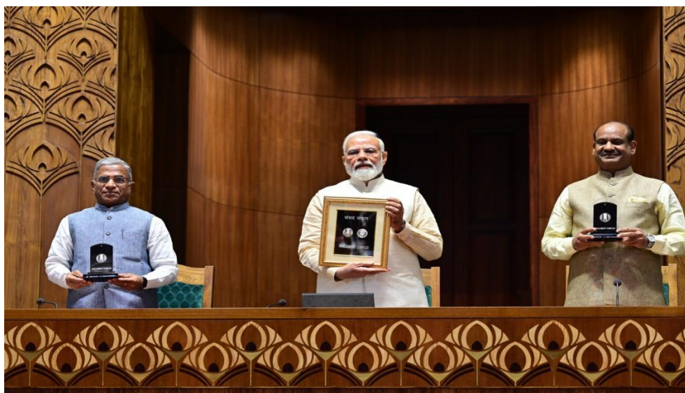
Prime Minister, Shri Narendra Modi; Lok Sabha Speaker, Shri Om Birla and Deputy Chairman, Rajya Sabha, Shri Harivansh releasing commemorative coin on the occasion of Inauguration of New Parliament Building on 28 May 2023.

With an august gathering of high dignitaries, Hon'ble Prime Minister of India inaugurated the New Parliament Building. The ceremony began by performing puja with Vedic rituals and the Prime Minister installed the sacred Sengol in the Lok Sabha Chamber. The Prime Minister also unveiled inauguration plaque to commemorate the occasion. Prime Minister, Shri Modi also felicitated eleven shramjeevis for their contributions towards the construction of the New Parliament Building. It was followed by a Sarva Dharma Prarthna Sabha performed by various religious gurus. The Prime Minister, Shri Narendra Modi; Lok Sabha Speaker, Shri Om Birla; and Deputy Chairperson, Rajya Sabha, Shri Harivansh released commemorative postage stamp and coin to commemorate the occasion.