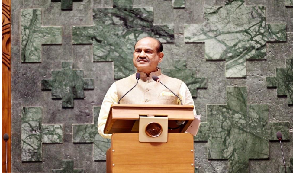
Lok Sabha Speaker, Shri Om Birla addressing distinguished gathering on the occasion of Inauguration of New Parliament Building on 28 May 2023.

Hon'ble Prime Minister of India, Shri Narendra Modi ji; Deputy Chairman of Rajya Sabha, Shri Harivansh Ji; Dignitaries, Ladies, and Gentlemen: