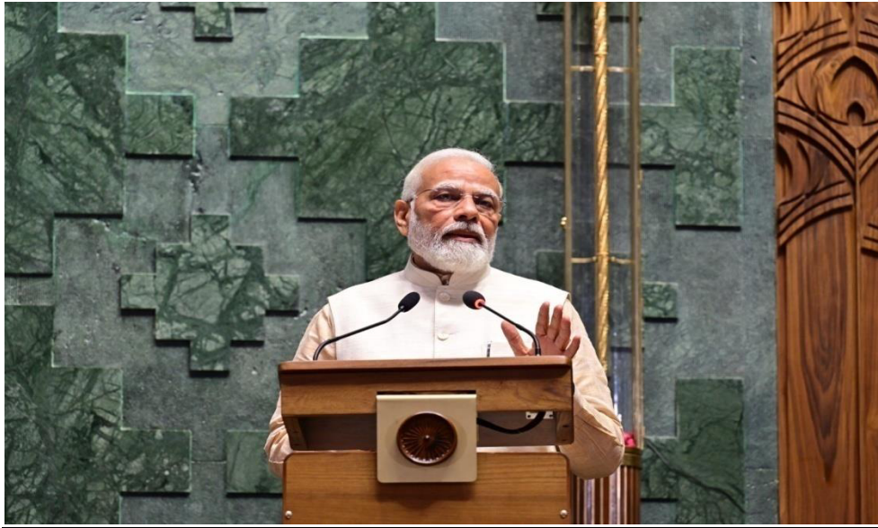
Prime Minister, Shri Narendra Modi delivering Inaugural Address in New Parliament Building on 28 May 2023.

1 Hon'ble Speaker of Lok Sabha Shri Om Birla ji, Deputy Chairman of Rajya Sabha Shri Harivansh ji, Hon'ble Members of Parliament, all senior public representatives, distinguished guests, all other dignitaries, and my dear countrymen!