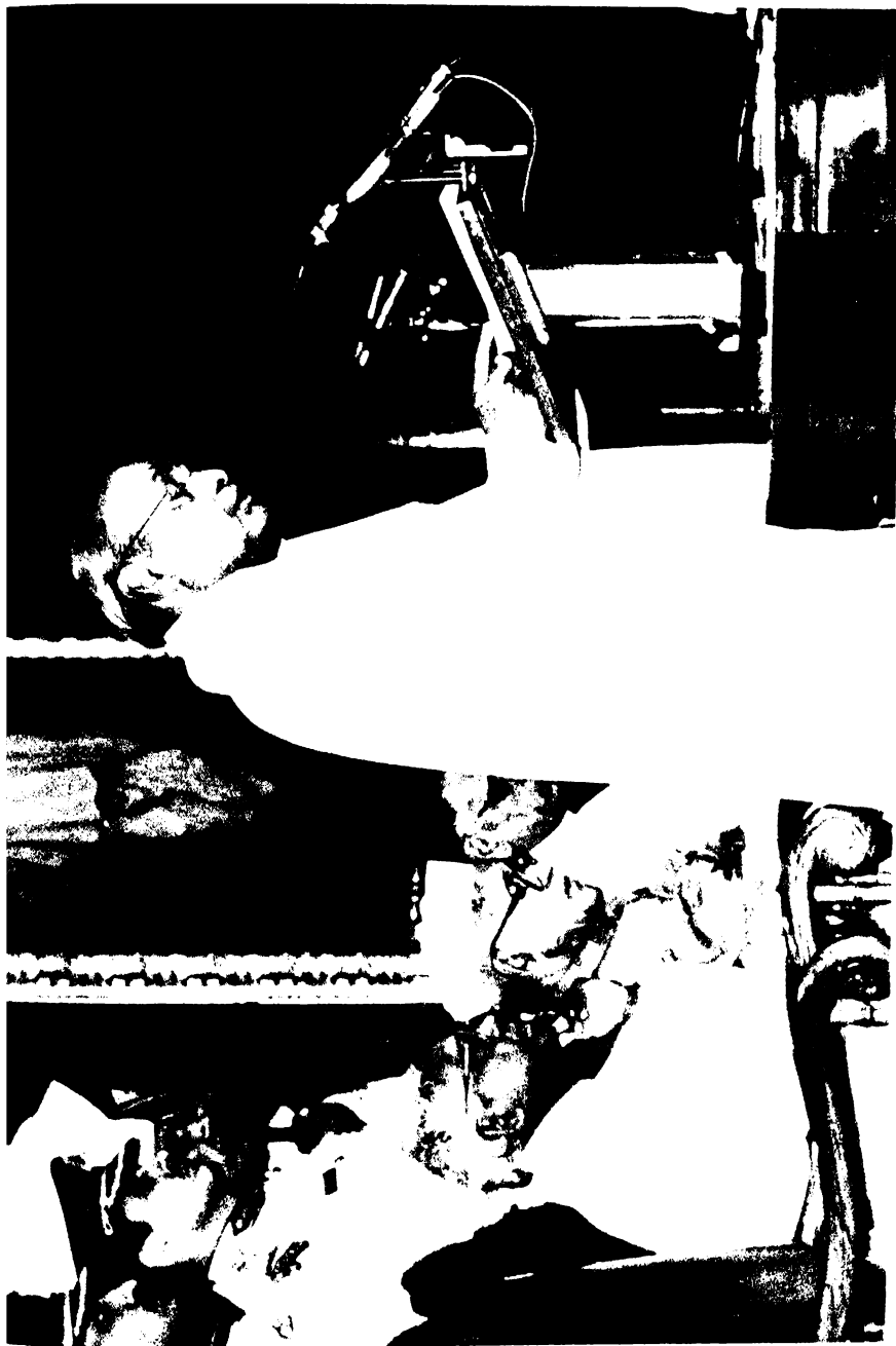
The Prime Minister, Shri P. V. Narasimha Rao addressing the gathering