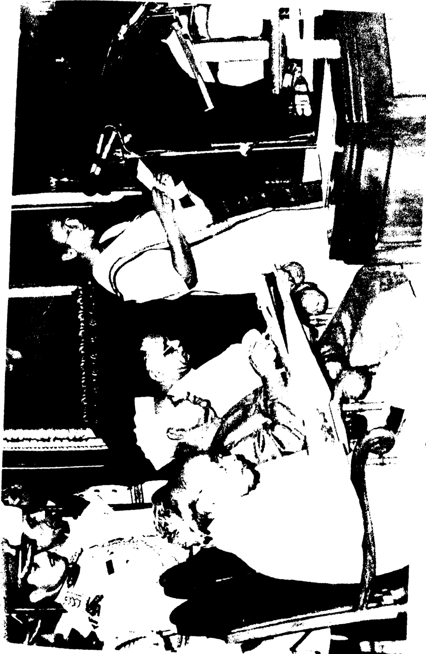
Smt. Meira Kumar addressing the gathering