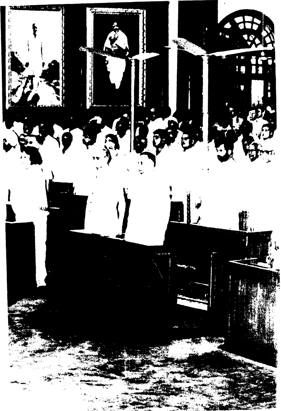
A view of the distinguished gathering in the Central Hall