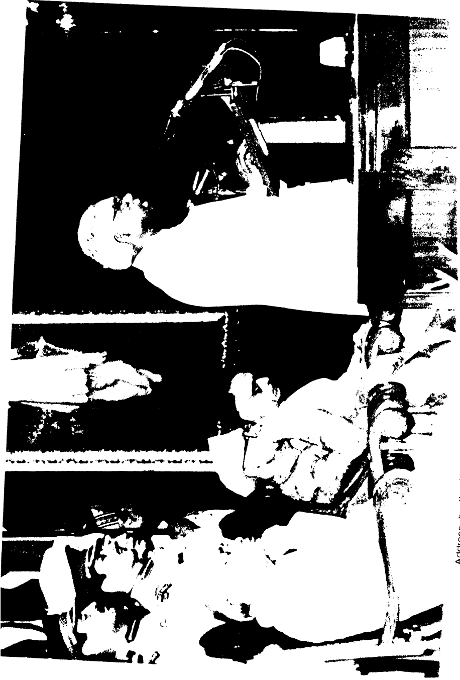
Address by the Vice-President of India and Chairman, Rajya Sabha, Shri K. R. Narayanan