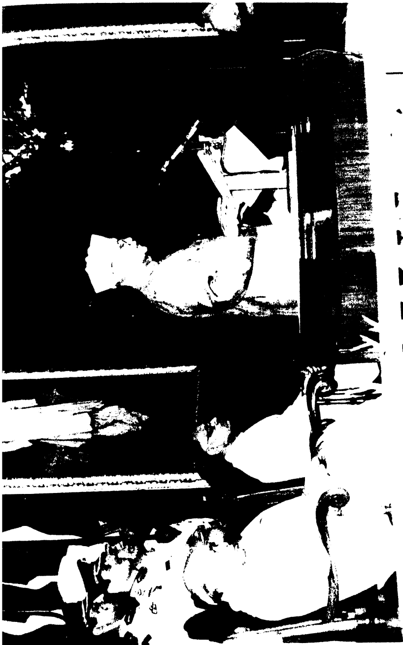
The President, Dr. Shanker Dayal Sharma addressing the gathering