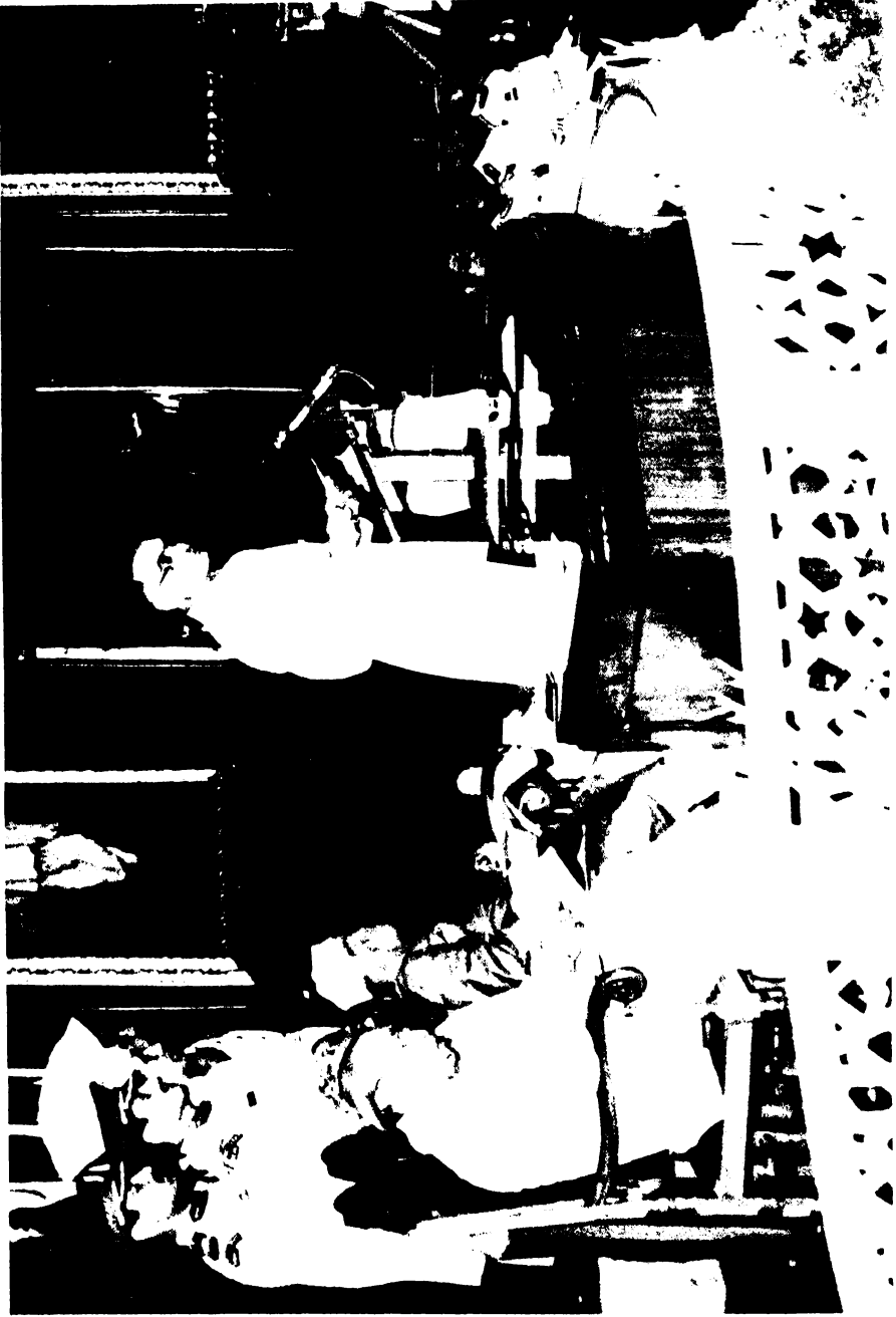
Address by the Speaker, Lok Sabha, Shri Shivraj V. Patil