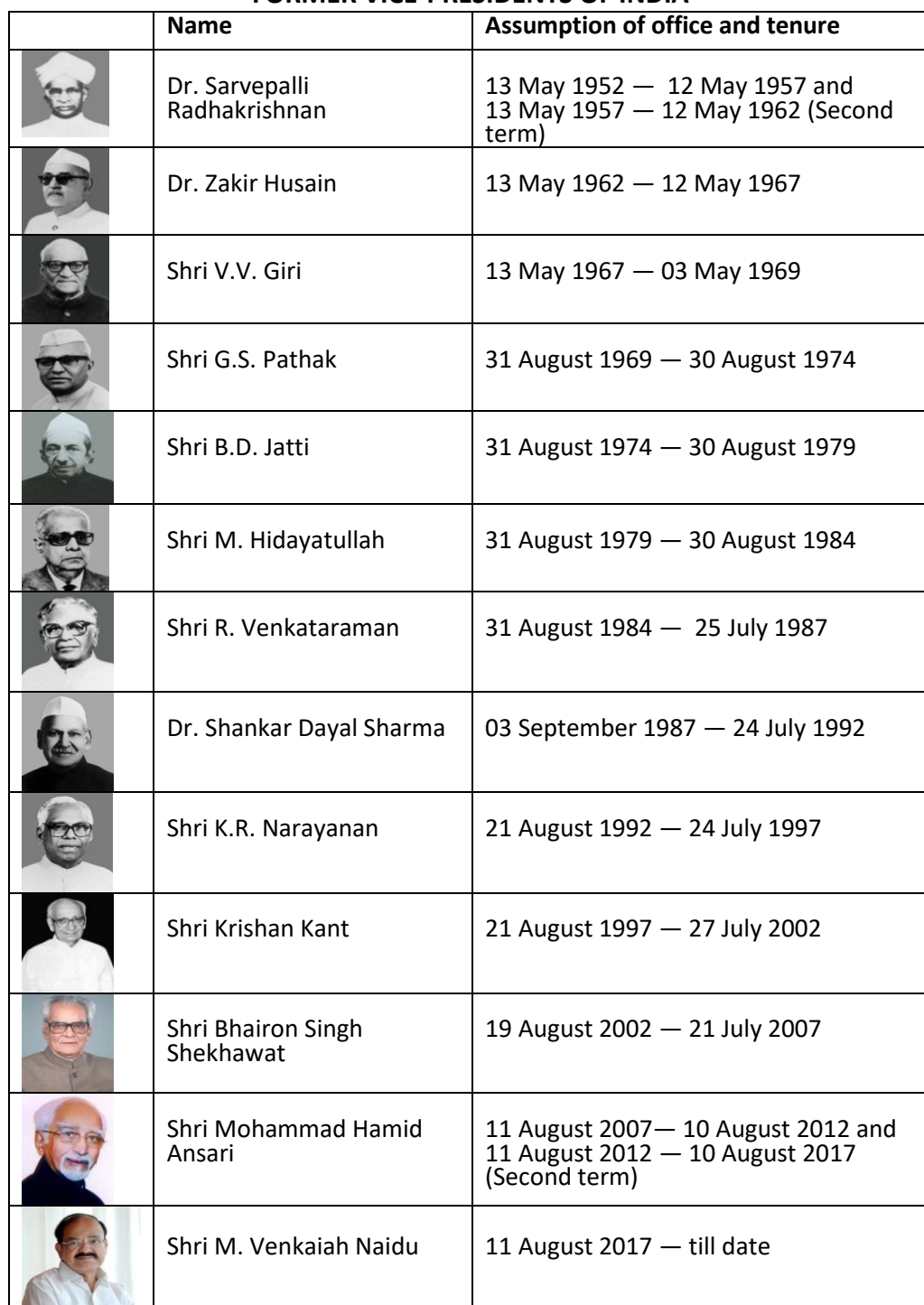
Table: 3 FORMER VICE-PRESIDENTS OF INDIA