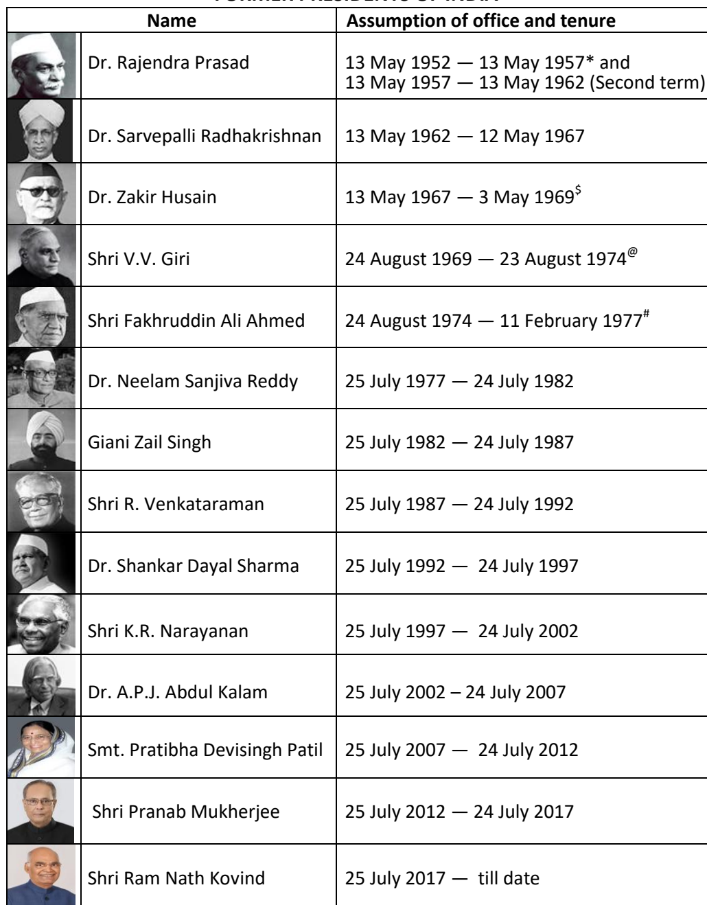
Table: 1 FORMER PRESIDENTS OF INDIA

* Dr. Rajendra Prasad was the interim President from 26 January, 1950 to 13 May, 1952.